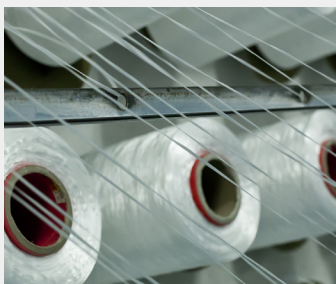
Exhibit 6. Automated industries in the developed markets

In addition to keeping the foundational pillars of success in sight, investors will also want to capture the opportunities related to five