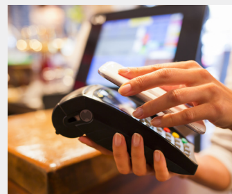
Exhibit 18. Investment opportunities in the digital economy

In countries with relatively underdeveloped bricks-and-mortar retail and young, digitally connected consumers, much of the growth will occur online in the form of e-commerce. In India alone, retail e-commerce sales are expected to grow from