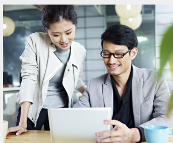
Exhibit 17. Investors should examine EM investment opportunities across three primary themes

Our analysis identified several long-term investment opportunities rooted in the new EM landscape we have described. These opportunities fit within three main themes: leapfrogging into the digital era, the rising urban middle class, and structural transitions in infrastructure and real estate as EMs modernize their economies. Within these broader themes, we have identified eight specific investment opportunities that can be pursued through a range of public and private vehicles. Collectively, they offer a spectrum of attractive avenues for investing in EMs. Note an important caveat: asset prices and relative valuations will always be the most critical factors for individual asset selection within these themes.