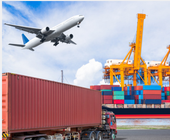
Exhibit 19. Investment opportunities from the rising, urban middle class

In particular, as per capita income in EMs rises and consumption patterns change, consumer durables should experience robust