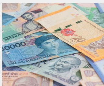
Exhibit 20. Investment opportunities from the modernizing emerging markets

We believe investors looking to participate in financing the enormous infrastructure and development needs of EM countries